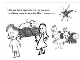
AWAY IN A MANGER

Full color corporate logo and executive signatures - add $50 per order. Call to arrange all personalized orders: 248-350-2203