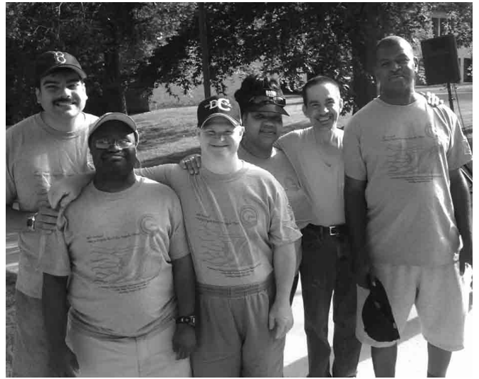
Men at our Longcrest Home participate in the walk