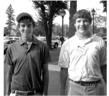
The Annual Golf Outing was blessed with beautiful weather and the smiling faces of wonderful volunteers!