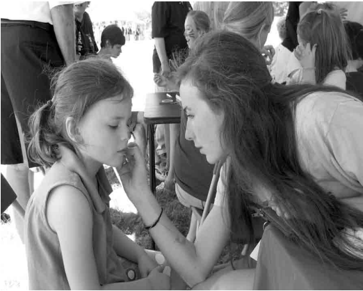
Family Fun Day lived up to its name once again, with the help of dozens of volunteers!