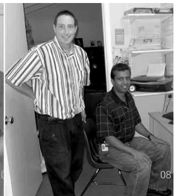
Ford Volunteers come through for Angels' Place time and time again. Their skill and dedication recently updated Angels' Place computers and improved Angels' Place Homes for residents!

Thank you to each and every person who has shared their time to benefit Angels' Place residents, homes, events or office. Angels' Place is enriched by the hard work, kindness and dedication of volunteers throughout the year!