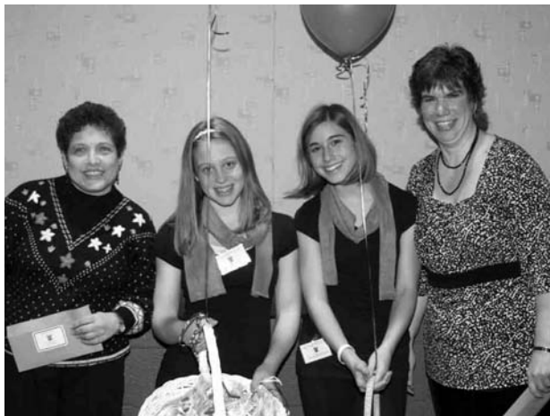
Residents and youth volunteers sold angel ornaments.