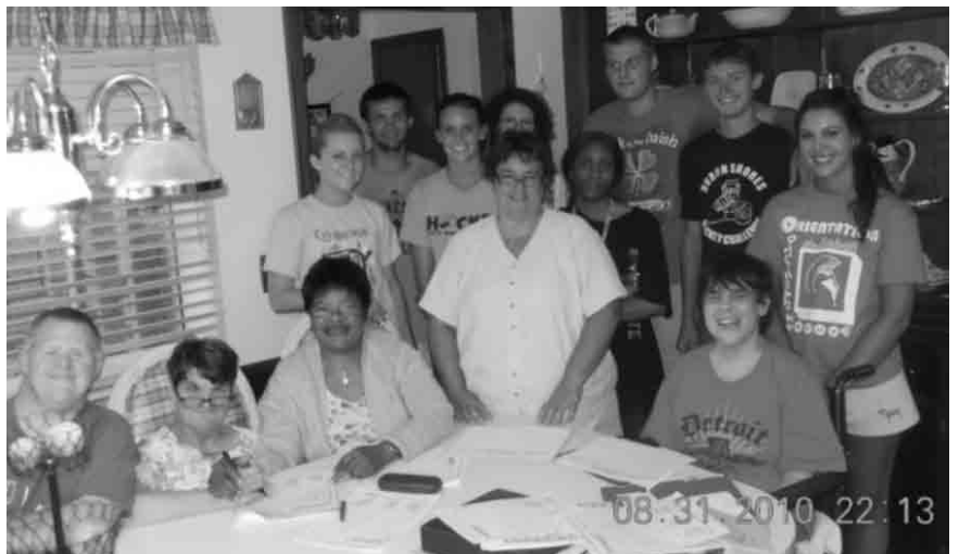
UDM incoming freshmen shared part of their welcome week with the Grimpladi & Dinan Homes. Led by UDM upperclassmen, the students pruned, raked & weeded in the yards and still found time to enjoy with the Enrichment Club!