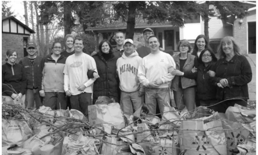
Volunteers from Kelly Services Headquarters in Troy vacuumed, scrubbed, raked & polished the VanElslander Home, inside and out, prior to move in day!

Angels' Place is enriched by the hard work, kindness and dedication of volunteers throughout the year!