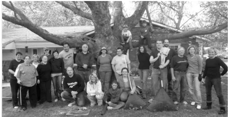
Kensington Church volunteers & Middlebury ladies pose for a photo after a busy morning of raking!