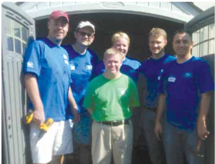
Ford Motor Company Fund and volunteers give back on Ford Service Days

Captains at the Detroit Yacht Club spent the day giving boat rides to residents; some who had never been on a boat!