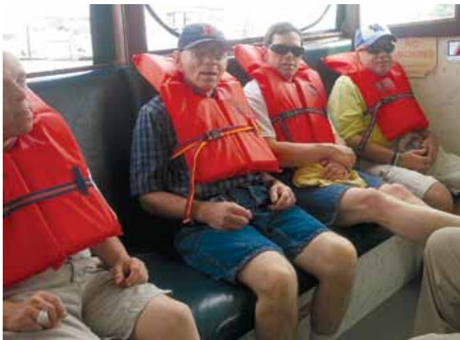
Went on boat rides thanks to friends of Angels' Place