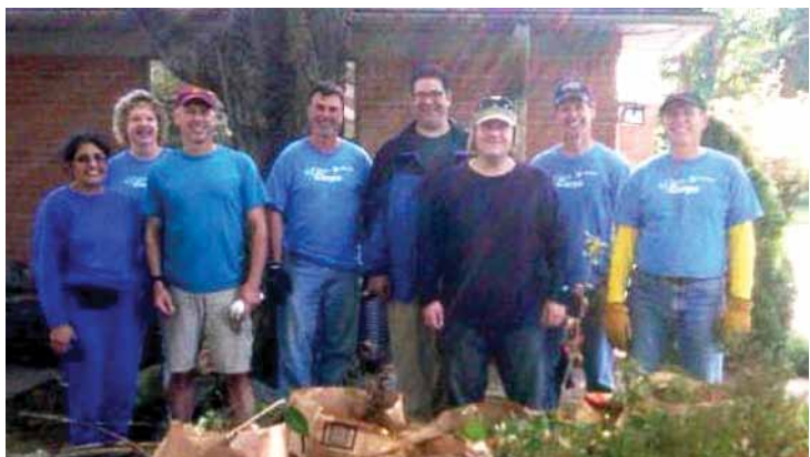
Volunteers from DTE Energy spend the day at our Mahon Home.