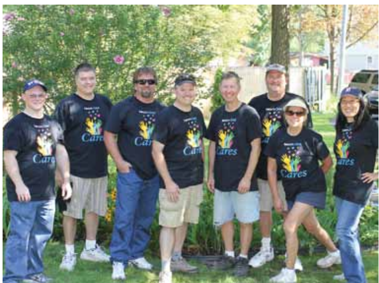
GM volunteers trimmed and tidied the front yard of our Webster Home