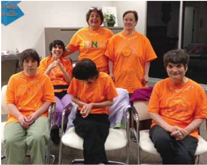
Attended a Tiger Game