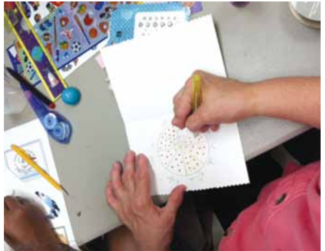
Residents in our Enrichment Program design greeting cards for our Angels' Place donors