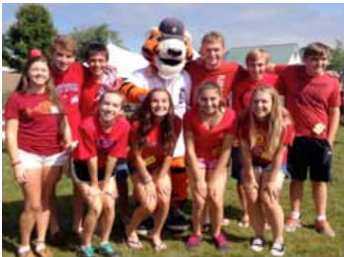
Angels' Place Youth Council at Family Fun Day