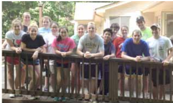
St. Mary of the Hills Youth Group